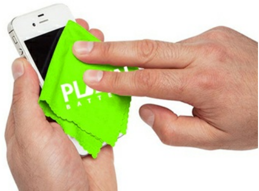
Ultra Opper Microfiber Cleaning Cloth >> CG4532