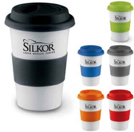
480ML Classic Travel Mug With Grip >> RG5239