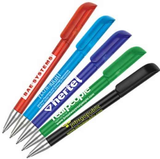
Twist Value Advertising Pen >> VDQU1