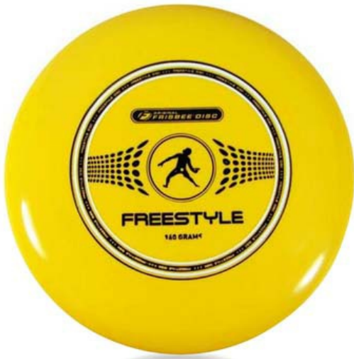
Polypropylene Flying Disk >> LG7435