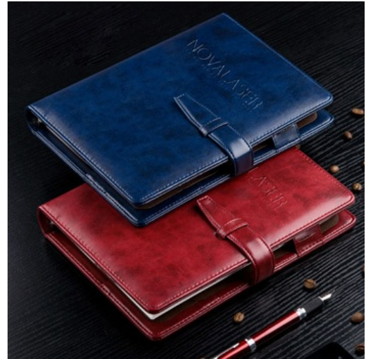
Vintage Buckle A5 Notebook >> BGQS1