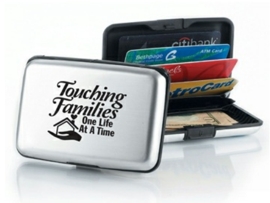
Aluminum Card Wallet >> NG5793