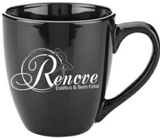
Fascinated Ceramic Mug >> JG6192