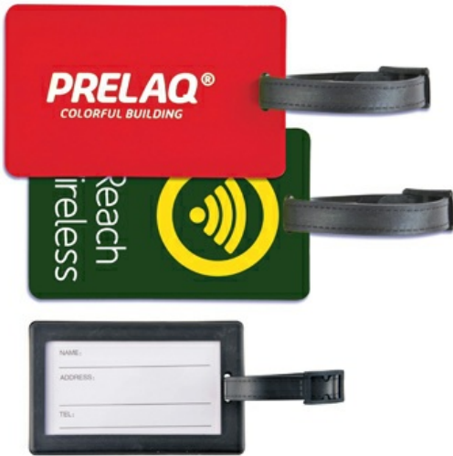
Custom Logo Shape Soft PVC Luggage Tag >> DG8965