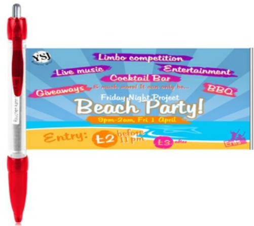
Scroll Pull Banner Pen >> ZG6854