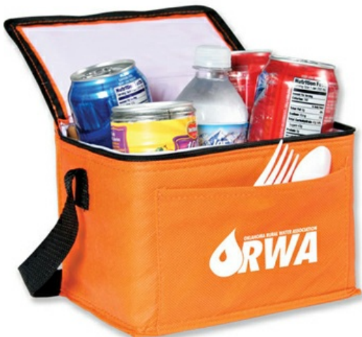
Non Woven Insulated Cooler Bag >> QG9352