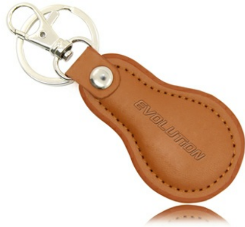
Cool Pear Shape Leather Key Chain >> EG3571