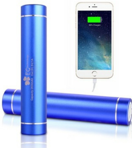
Cylinder USB Emergency Charger Bank >> DG8197