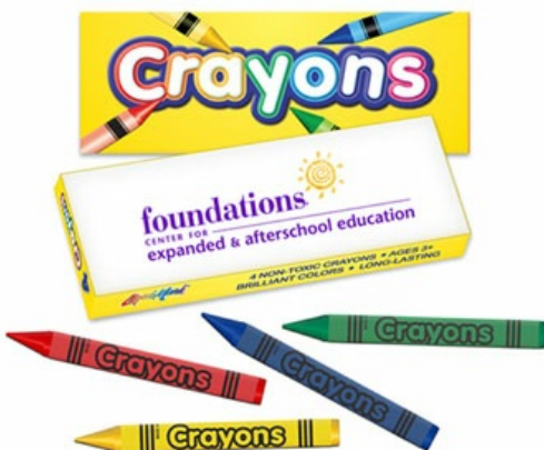
Premium Color Crayons Pack of 4 >> QG2789