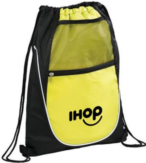
Net Pocket Zipper Personalized Drawstring Backpack >> QG7192