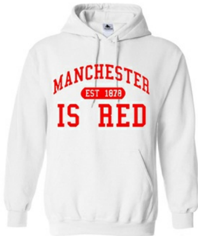
Men Cotton O-Neck Sweatshirt Hoodies >> PG5296