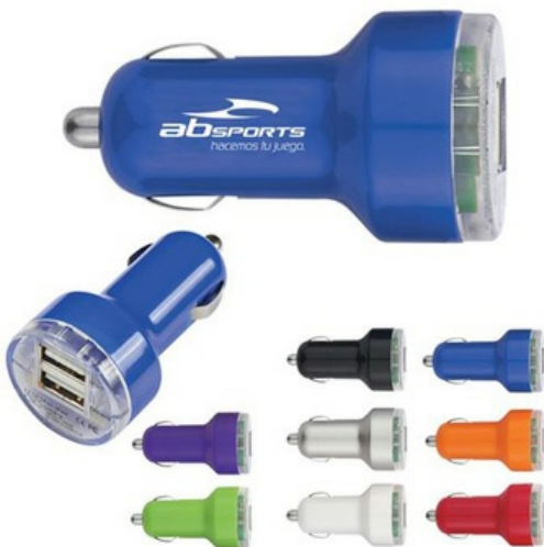
Dual USB Mini Car Charger >> BG3175