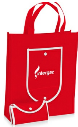
Rolling Non-Woven Foldable Tote Bag >> EG3975