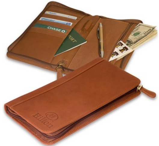
Calfskin Zip-Around Document Holder >> EG2937