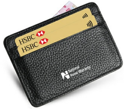
Slim Bank Credit Card Holder >> ZG2697