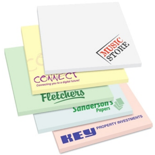
Sticky Note Pad >> MG9564