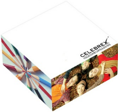
Sticky Note Cube Pad >> RG1497