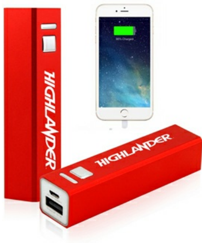
Mobile Phone 2200mAh Power Bank >> PG1673