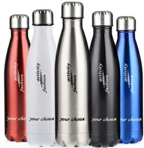
Double Walled Stainless Steel Hydration Bottle >> LG1478