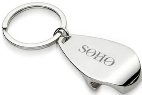
Glossy Chrome Bottle Opener Keychain >> KG1362