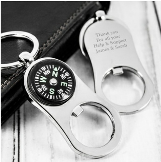
Metal Bottle Opener Compass Keychain >> GG7639