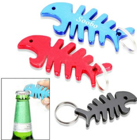
Fish Bone Bottle Opener Keychain >> BG6185