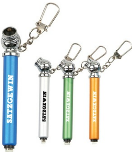
Custom Mini Tire Gauge Keychain >> DG7324