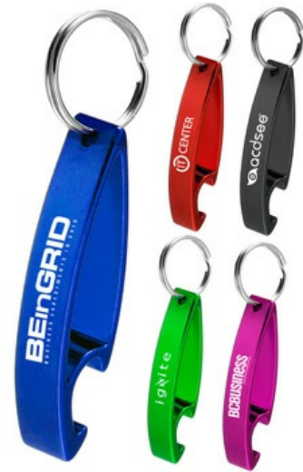
Ergo Aluminium Keychain Bottle Opener >> WG6957