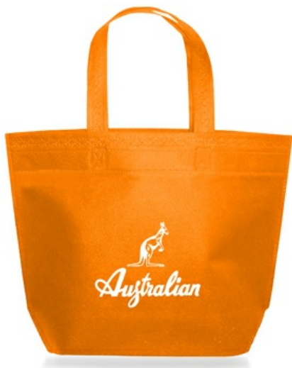
Non-Woven Reusable Tote Bag >> VJTW1